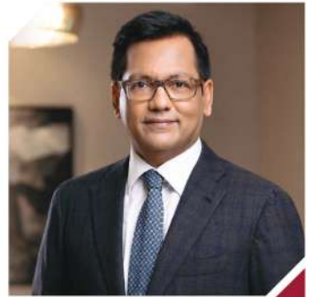
Dr. Vijay D. Patil

"Learning @ D Y Patil University is boundless. We are focussed to equip people with knowledge and requisite skills they need to succeed. We are unique, as we follow holistic modes of offering scholastic knowledge & acumen. We are one of the first institutes to pioneer courses that give students practical, industry-oriented interface along with traditional academic learning"